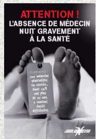
Poster of General Council of Saône-et-Loire

The government and the French health insurance developed various incentive actions in order to attract health professional in rural area. At the same time, local authorities have initiated measures with the same intention: creation of multidisciplinary health homes, general medicine internships, training of general practice to become tutors, helps to health professionals' installations.